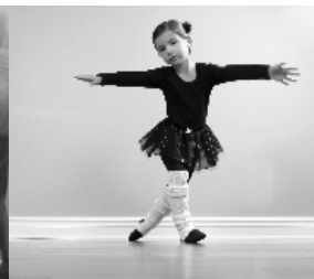
Twinkle Stars Showcase