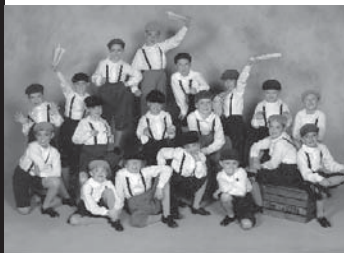
"DANCE TIMES" Show

Look for CSD's Fall Schedule of classes to be released April. Open Registration for ALL CSD Students will begin May 3 at 9 am. Registration will be open to the general public on May 17. For more information, call 303-841-7233 or visit us 24/7 at www.coloradoschoolofdance.com .