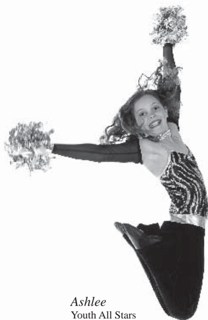
Ashlee Youth All Stars Student since 2005

IMPORTANT DATED RECITAL INFORMATION ENCLOSED!