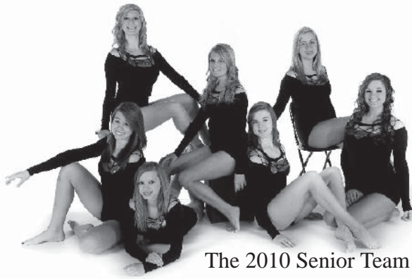
The 2010 Senior Team