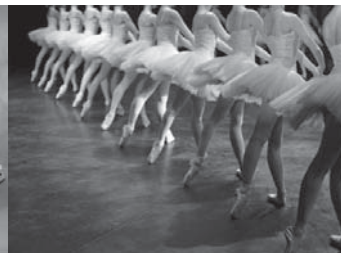
SLEEPING BEAUTY BALLET